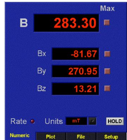
Example for a numerical results display