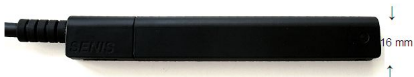
Figure 2: Probe with removed cap (THM1176-HF only)