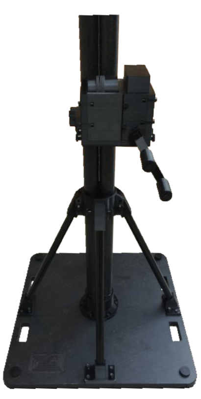
Gradual and effortless lifting winch safety self-locking system to prevent the load from falling