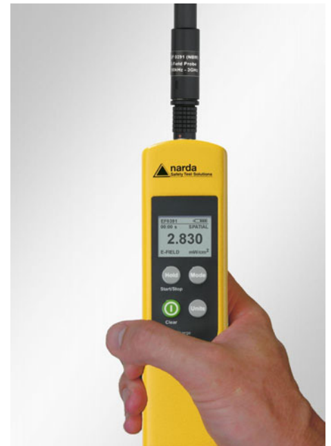
Small, lightweight and rugged design – ideal for use in rough environments