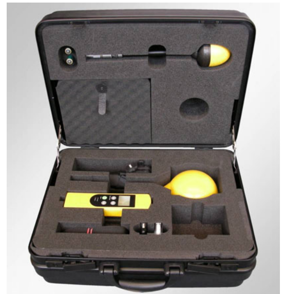
A rugged transport case is included. This provides ideal protection for the instrument, together with up to two probes and all accessories.