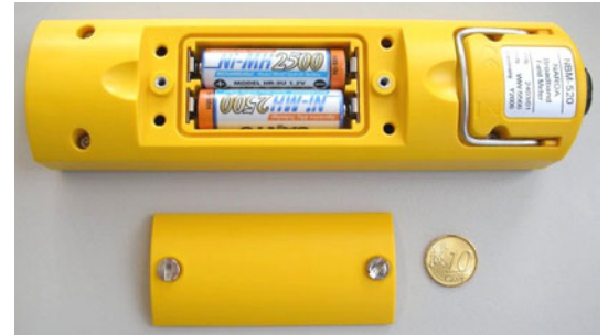
The battery compartment is opened easily using a coin. Two replaceable NiMH rechargeable batteries (AA size) are used to power the device.