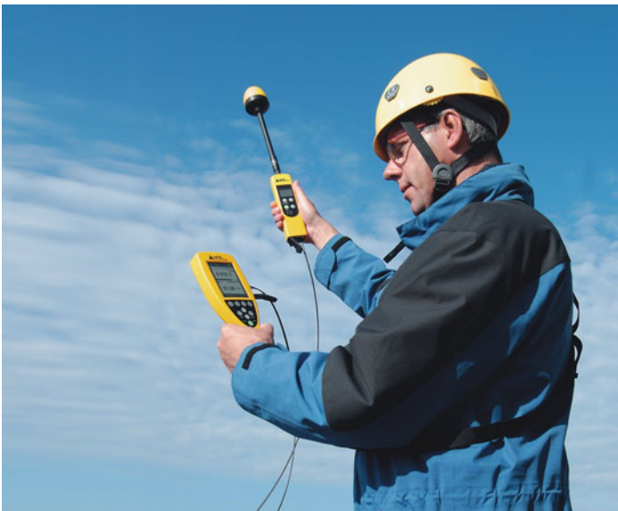
Probe extension using an optical cable: The NBM-550 acts as controller and displays the results. The smaller NBM-520 acts as the optical probe interface. Both devices can also be used separately as measuring devices when fitted with probes.