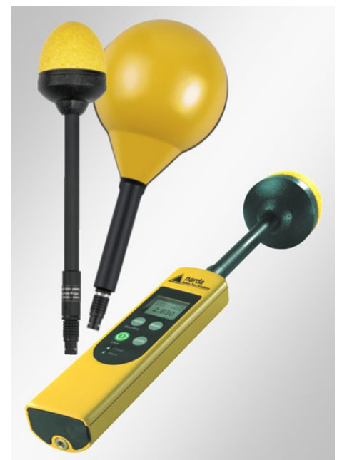
Changing the probe is quick and easy, with no need to reconfigure the device